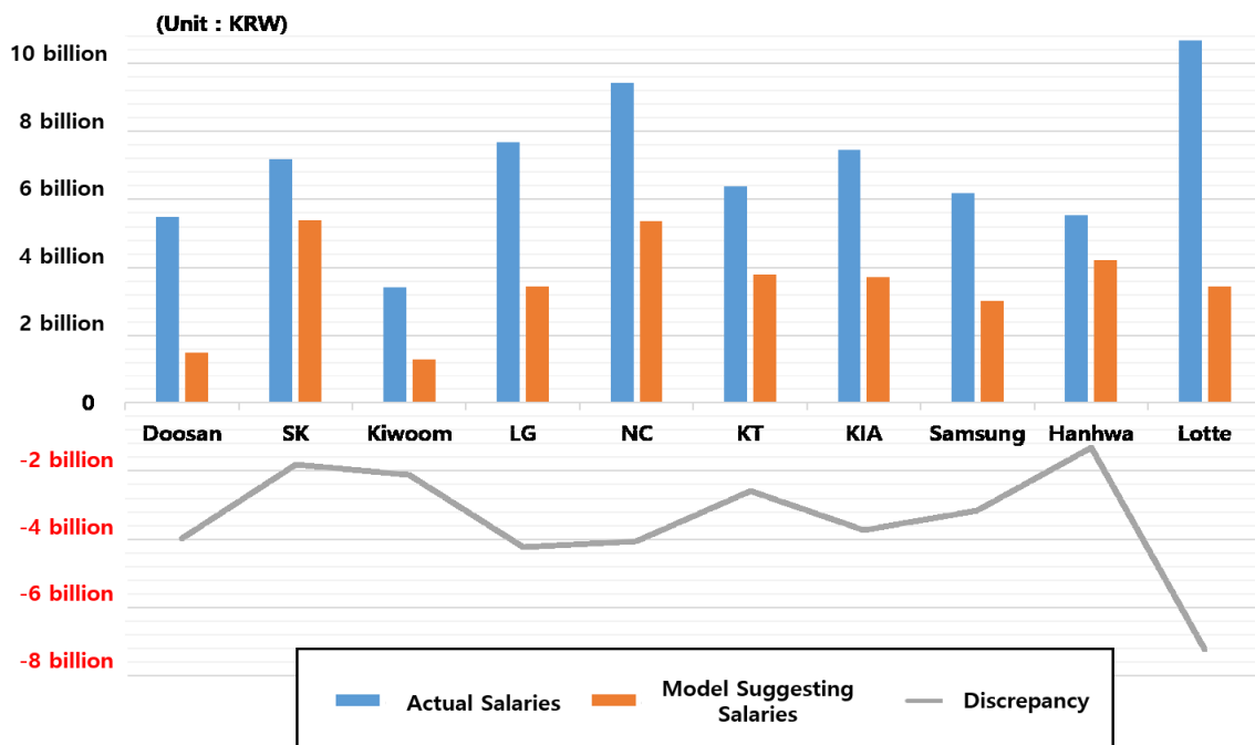
Figure 1. Actual KBO Team Salaries and the Expected Monetary Value in 2019